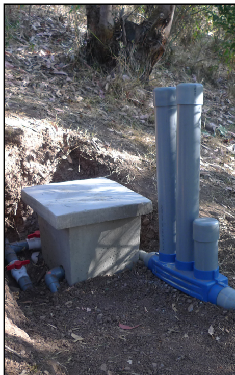
A chlorine dosing system that was installed by the EWB Peru Team

The EWB Peru Team was one of several teams that the University of Maryland sent out this year. Other teams have recently completed projects in Brazil and Ecuador. For more information about EWB at the University of Maryland, visit their website: http://www.eng.umd.edu/ewb .