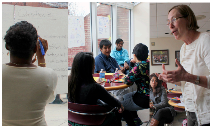
LASC students and faculty during the March 19th retreat